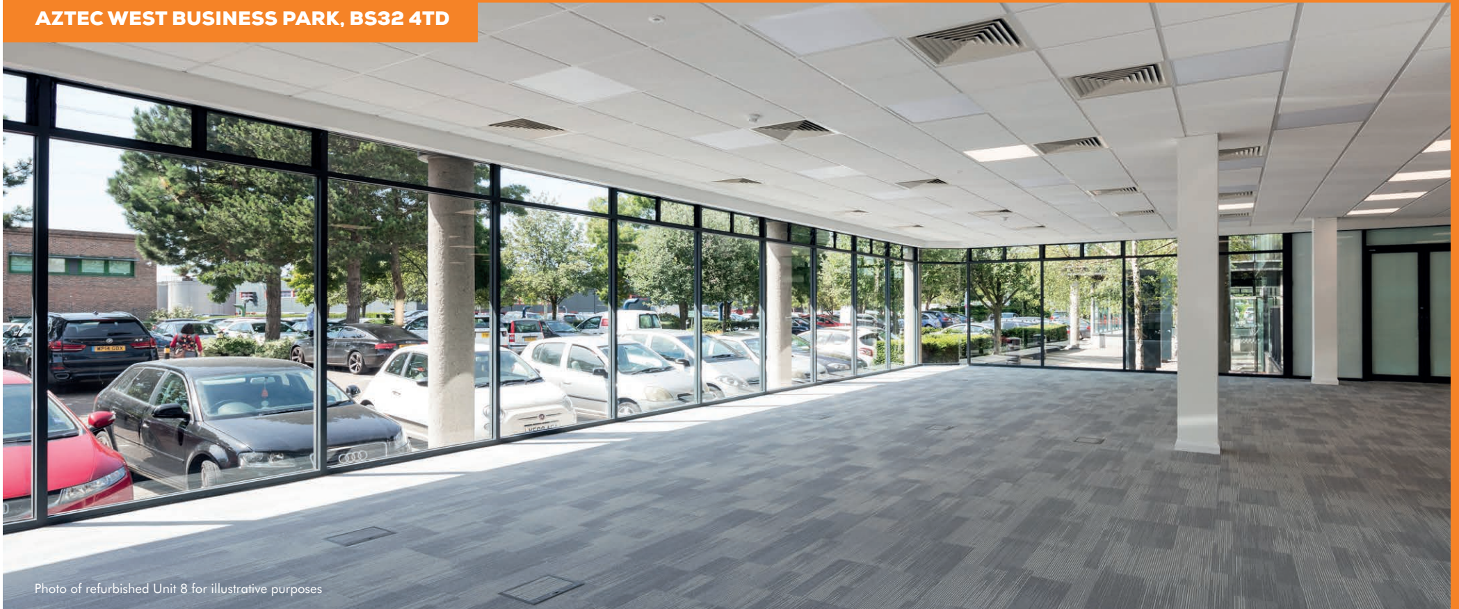
Photo of refurbished Unit 8 for illustrative purposes

UNIT 6 TO LET 1,071 SQ FT LAST REMAINING GROUND FLOOR UNIT