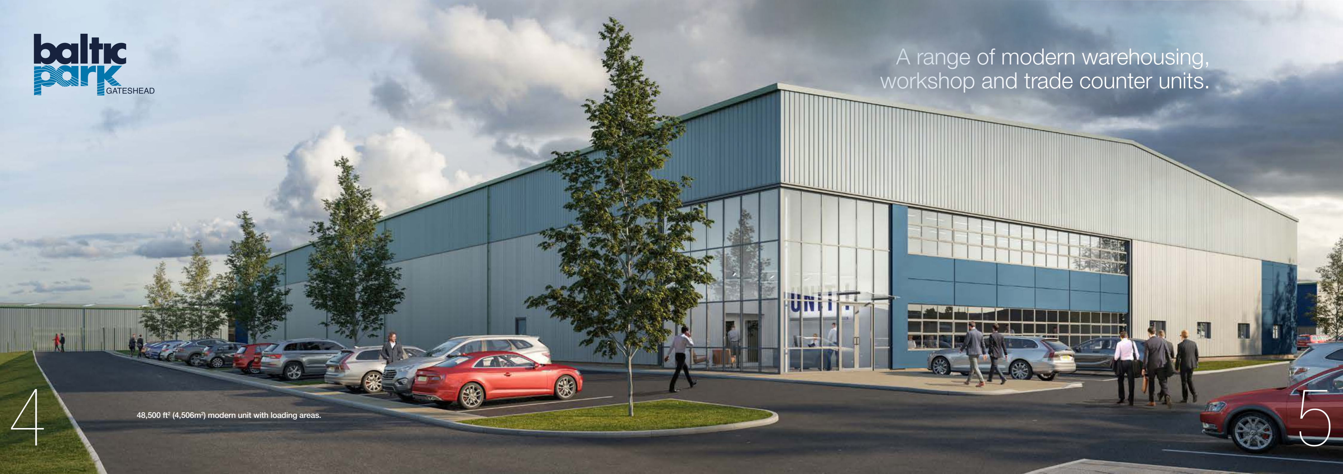
48,500 ft 2 (4,506m 2 ) modern unit with loading areas.

A range of modern warehousing, workshop and trade counter units.