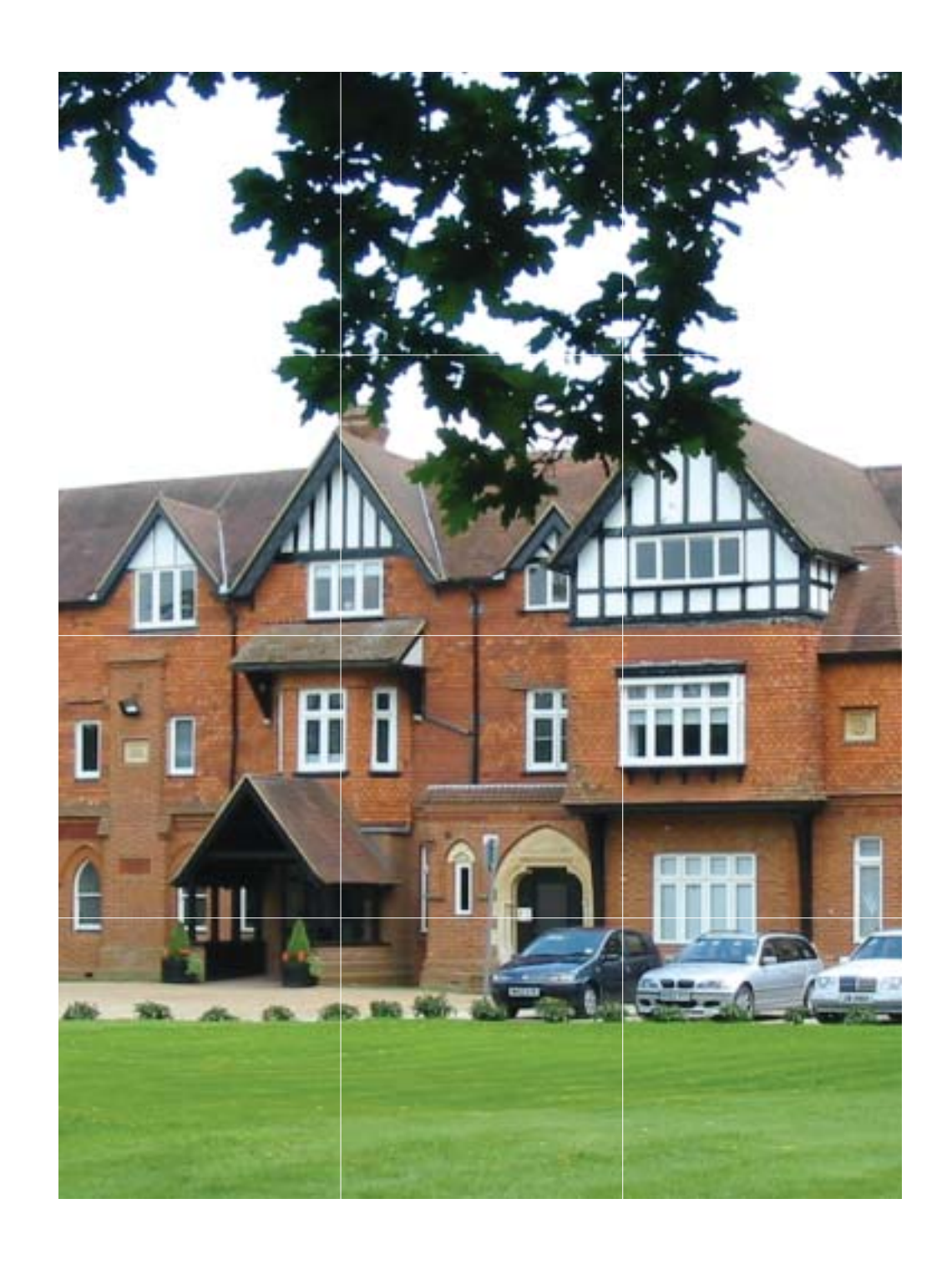
Orchard Lea Windsor