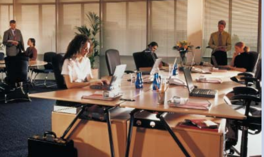
A typical Regus Office