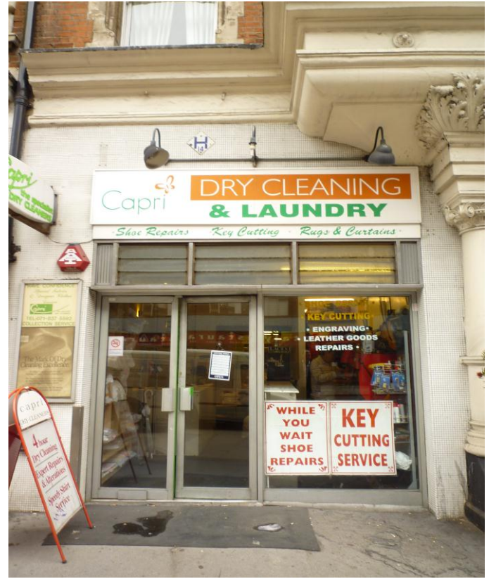
2,045 Sq Ft (190.05 Sq M)